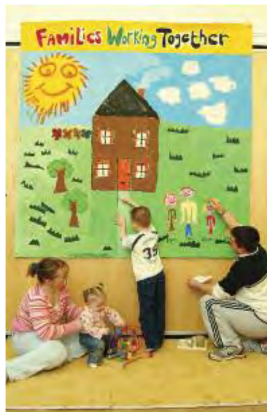
Quarriers Family Resource Centre is working to keep families together in areas of significant disadvantage in Glasgow

Hence a person's life chances are often predicated on their experiences in childhood. A child's ability to engage at school is in part determined by their home life, and their subsequent (un)employment likewise.