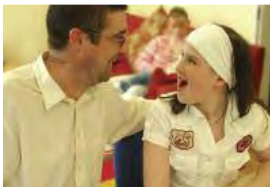
Through the provision of non-stigmatising and multi-disciplinary support, Quarriers Family Resource Centre is keeping families together in Glasgow. The charity is having a huge impact on the community it serves.

Family breakdown reflects and perpetuates the levels of deprivation and worklessness – with its associated outcomes such as crime and addiction – that