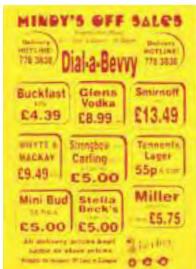
Dial-a-Bevvy: alcohol consumption is destroying Glasgow’s most hard-pressed communities. Alcoholic liver disease is Glasgow’s biggest cause of ‘premature death.’

We therefore recommend an expansion of third sector abstinence based provision, such as that provided by the Maxie Richards Foundation. Charities with proven track records in enabling addicts to become drug free focus on the individual as a whole and hence tackle the causes not just the symptoms of addiction.